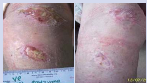
The venous leg ulcers at the start of the study and healed at week 5

The patient rated the dressing as comfortable and was 'satisfied' with her treatment experience