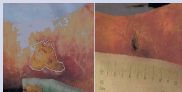
The mixed aetiology leg ulcer at the start of study and at week 6