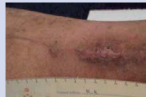
The non-healing surgical wounds at the start of the study and (healed) at week 5