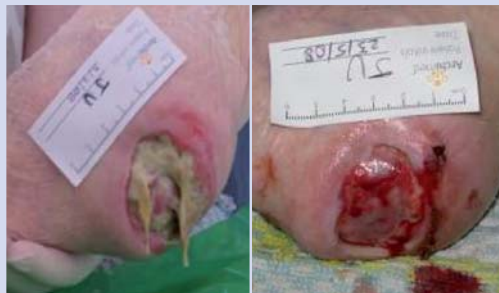
The pressure ulcer at the start of the study and at week 6